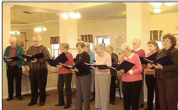
Second Avenue Baptist Church Choir