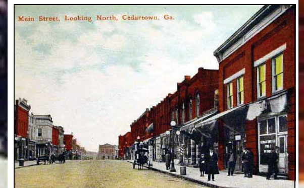
Main Street, Looking North, Cedartown, Ga.