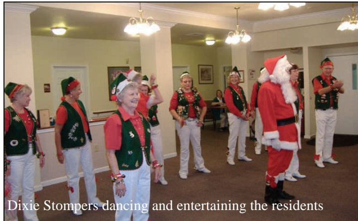
Dixie Stompers dancing and entertaining the residents