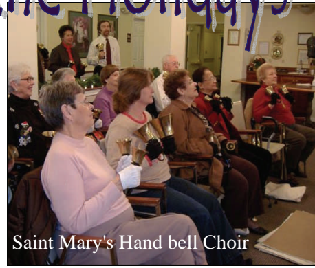
Saint Mary's Hand bell Choir