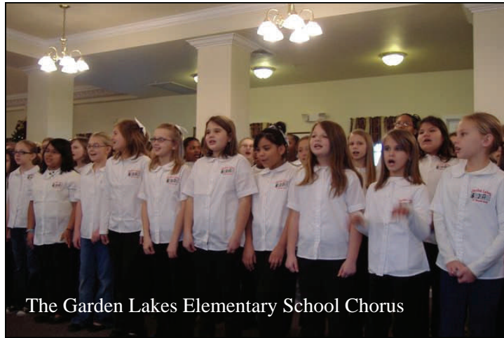
The Garden Lakes Elementary School Chorus