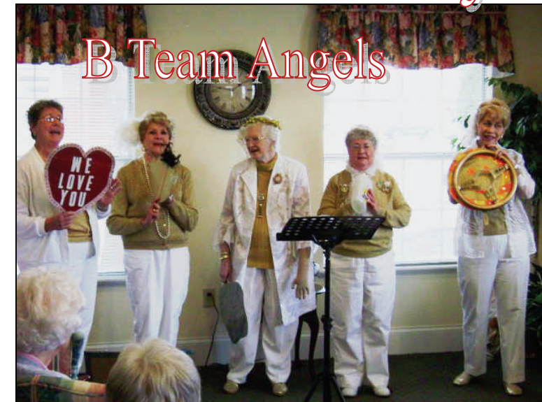
B Team Angels