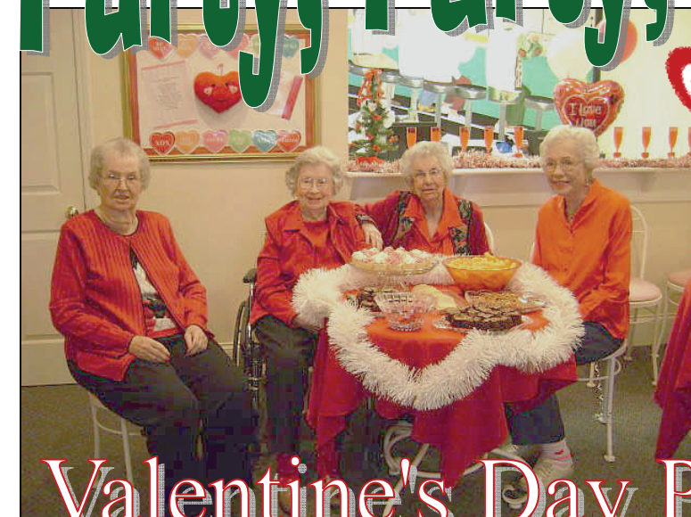
Valentine's Day Party