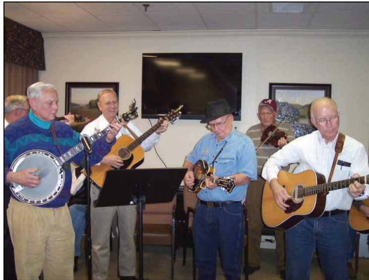
The Georgia Mountain Music Club are frequent guests of Winthrop Court and bring a medley of toe tapping, knee slapping selections. The groups is well known in the area and a favorite with the residents. They perform at Winthrop Court several times each year and bring joy and laughter to the residents.